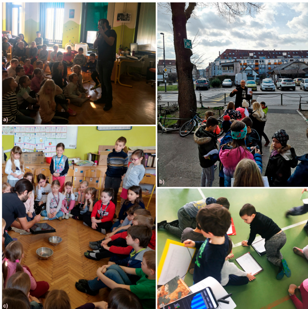
Figure 1. STDE activities: (a) demonstration of noise measurement devices; (b) mentors explaining details from data collection; (c) “Dancing rice” experiment; and (d) pupils performing measurements and recording data in a school gym.